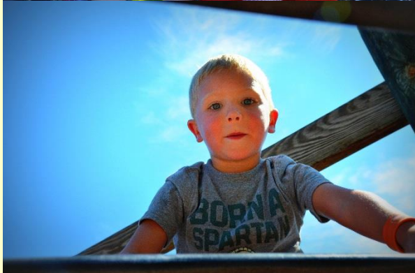
Our friends had a great time at the NFC Play Date at Castle Park!